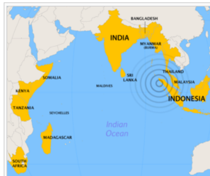
Countries most directly affected by the 2004 Indian Ocean earthquake

http://www2.ttcn.ne.jp/honkawa/0920.html